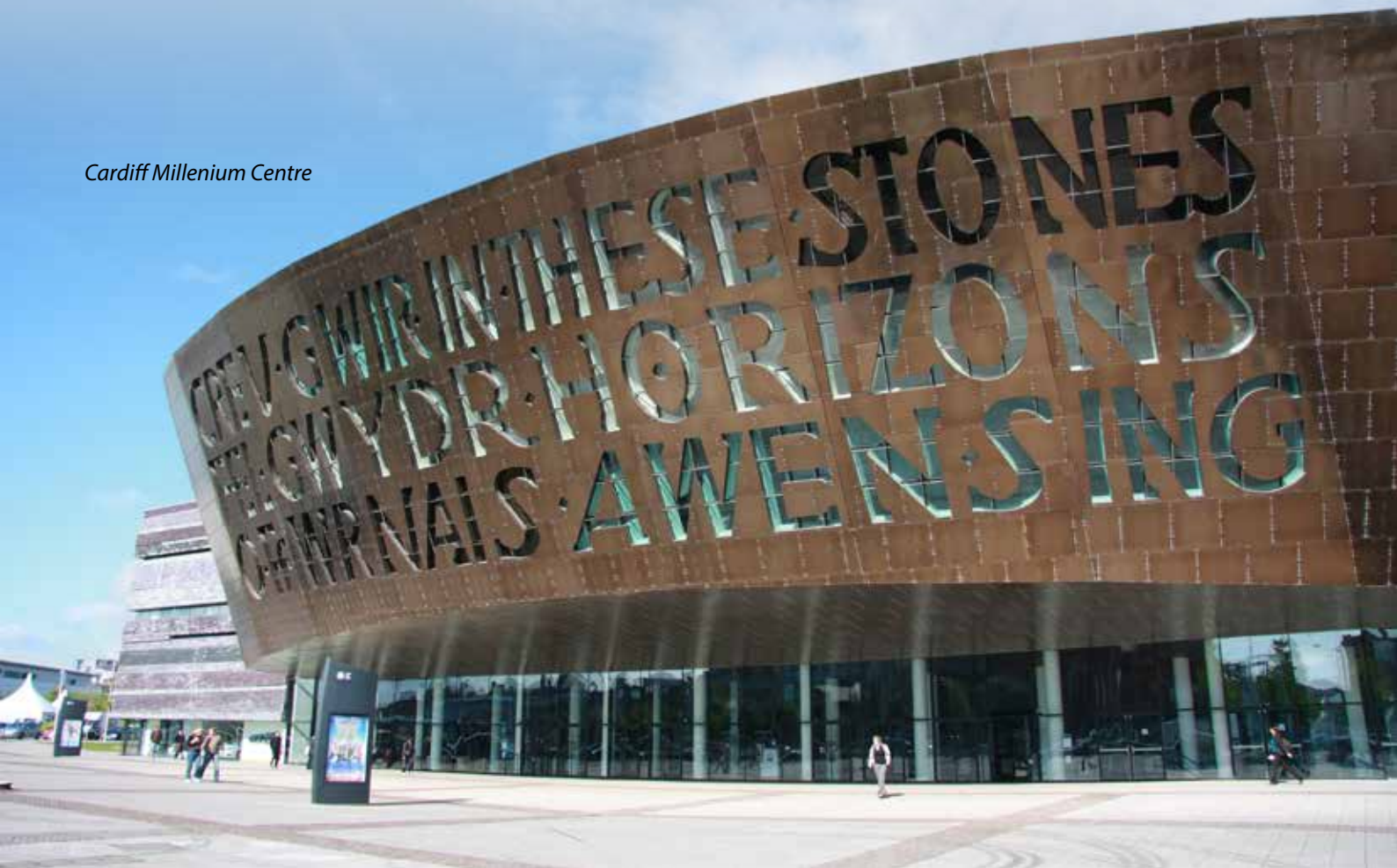
Cardiff Millenium Centre

The UK is bursting with famous cities. Historic cities such as Bath and Chester have magnificent ruins and make for pleasant trips. Manchester, Brighton, Bristol and Newcastle to name but a few are cosmopolitan and modern cities which have a world famous nightlife as well as thriving cultural scenes. Alternatively you might like to visit Liverpool, the home town of the Beatles and the European City of Culture 2008. The capital cities of London and Edinburgh are not to be missed on a visit to the UK, and if you visit it is recommended that you stay for several days.